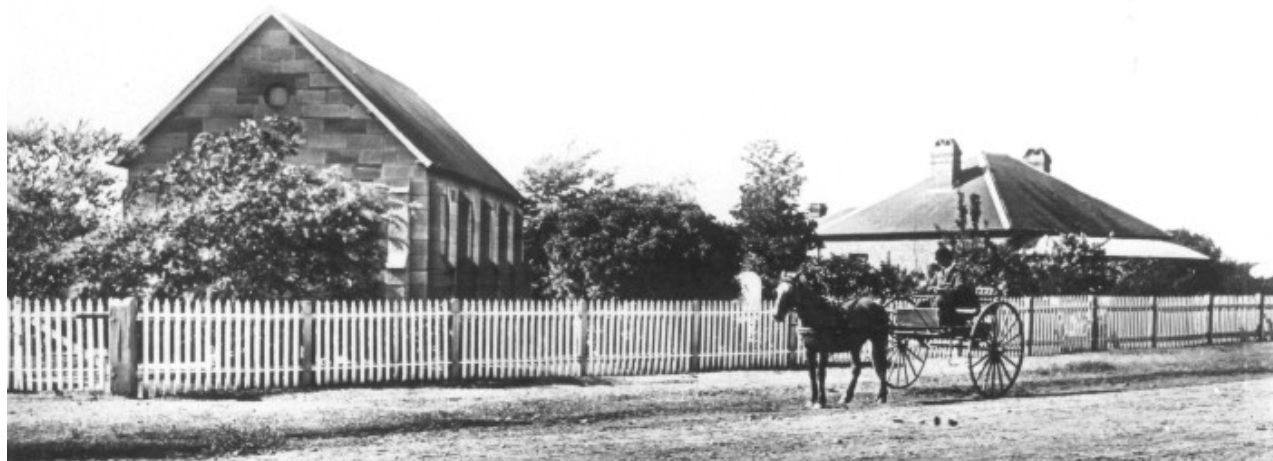
Scots Church Pitt Town was opened in 1862. The manse (right) was built in 1883.

Scots Church Pitt Town was dedicated on 25 May 1862, the congregation 'very numerous' and the Reverend Craig of Parramatta preaching a 'very edifying and impressive sermon' on the occasion. The parish minister at the time was the Reverend George MacFie. In 2012 Scots Church will celebrate its 150th anniversary.